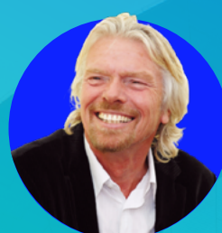
Sir Richard Branson Founder Virgin Group