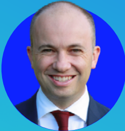
Matt Kean Treasurer, Minister for Energy & Environment, NSW