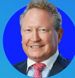
Andrew Forrest AO Chair & Founder Fortescue Metals Group