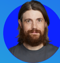
Mike Cannon-Brookes Co-founder & Co-Chief Executive Officer, Atlassian